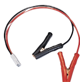
Alligator Clamp Battery Interface P/N 874-946-20