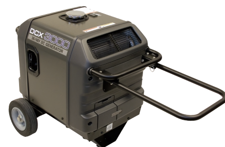
AlphaGen with optional Wheel Kit and Locking Handle