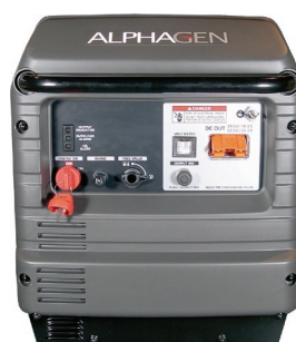
AlphaGen front view