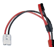
Y-Adaptor Battery P/N 874-946-22