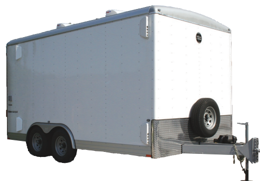
AlphaGen Portable Trailer

For contact information visit www.alpha.com